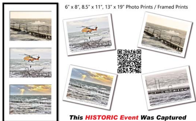
6" x 8", 8.5" x 11", 13" x 19" Photo Prints / Framed Prints

This HISTORIC Event Was Captured By ARTographer Ric Wallace Perfect Keepsakes for Generations to Come